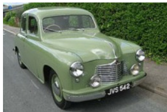
1949-1954 - SM 1500