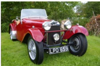
1938-1956 - Engines for HRGs