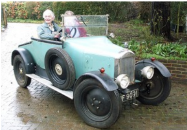
1912-1924 Singer 'Ten'

A variety of cars, vans, trucks & buses were produced into the 1920s. The cars included the famous 10 hp, production of which continued throughout the First World War alongside munitions work. It was the Singer 10 hp on which Lionel Martin based his motor-racing success, subsequently founding the Aston Martin marque. The 'Ten' lasted well into the 1920s, developing into the Singer 10/26 for the 1925 and 1926 seasons, after which it became the Senior.