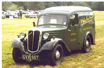
1939 Bantam Van