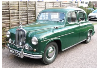
1954-1956 - Hunter