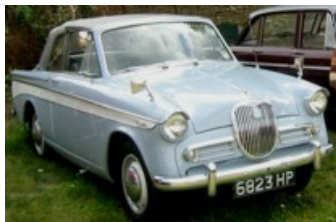
1956-1966 - Gazelle Ser I - VI