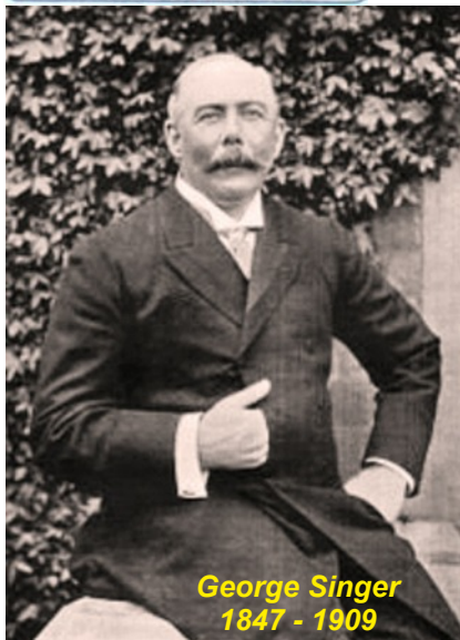
George Singer 1847 - 1909