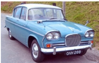
1961-1966 - Vogue Mk I - Mk IV