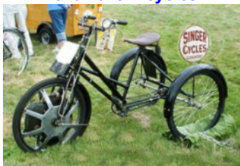
1901-1904 Motor Wheel