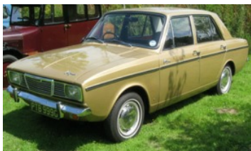
1966-1970 - Arrows Range Gazelle Ser VII & Vogue Mk V