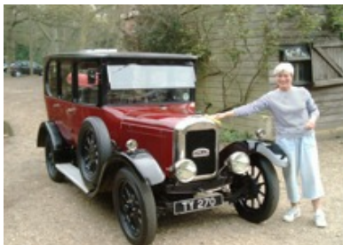
1925-1926 Singer 10/26

1926 was a significant year for Singer, when the Junior was introduced. This had a new, 848 cc overhead camshaft (ohc) engine, the basic design layout of which was used in the majority of Singer's subsequent models, and can still be