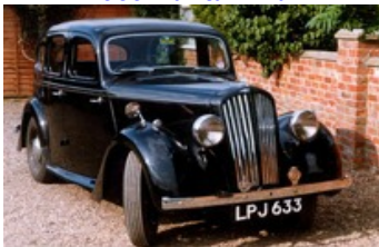
1937-1948 - Ten & Twelve