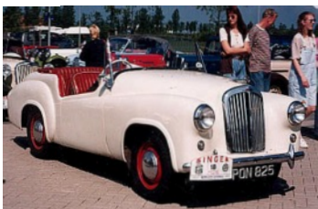
1954 - SMX Roadster