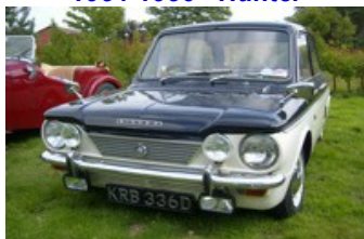
1964-1970 - Chamois Mk 1 & 2