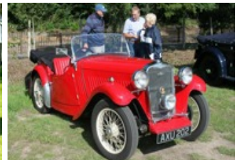
1933-1937 Sports/Le Mans