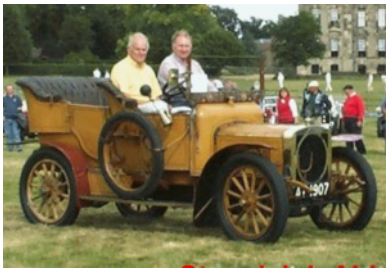
1907 Singer 12-14 HP