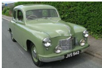
1948-1954 - SM 1500