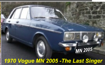
1970 Vogue MN 2005 - The Last Singer