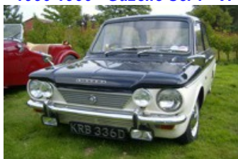
1964-1970 - Chamois Mk 1 & 2