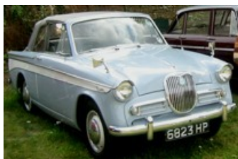
1956-1966 - Gazelle Ser I - VI