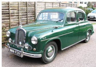
1954-1956 - Hunter