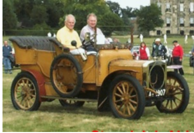
1907 Singer 12-14 HP

The first Singer motorised vehicles. In 1900 Singer obtained a licence to manufacture the Perks & Birch 'Motor Wheel'. This was a fabricated aluminium wheel, driven by a built-in, 2 hp engine. Motor Wheels were fitted to bicycles and tricycles with strengthened frames. Production continued until 1904-05, with several variants, including a milk churn carrier, a 'Governess' type body, a Tri-Voiturette, and the Fore-Car, predecessor of the Tri-Car.