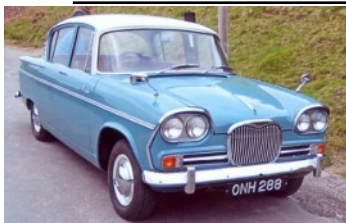
1961-1966 - Vogue Mk I - Mk IV