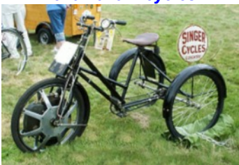
1901-1904 Motor Wheel