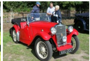
1933-1937 Sports/Le Mans