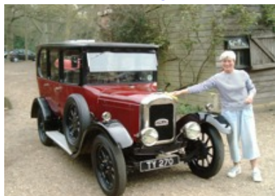
1925-1926 Singer 10/26

1926 was a significant year for Singer, when the Junior was introduced. This had a new, 848 cc overhead camshaft (ohc) engine, the basic design layout of which was used in the majority of Singer's subsequent models, and can still be