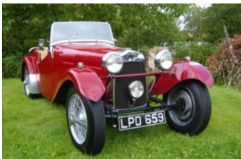
1938-1956 - Engines for HRGs