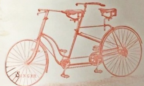
SINGER TANDEM SAFETY.