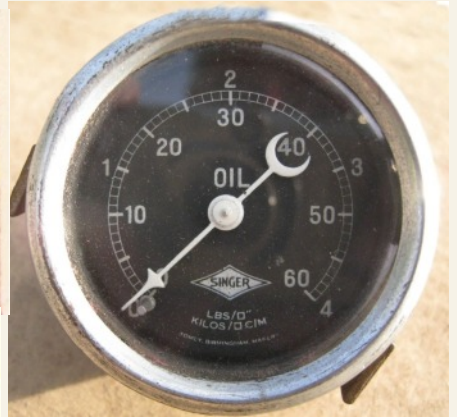
Singer-car-oil-pressure-gauge- O-to-60-PSI-Original-working - Sold for £33.99