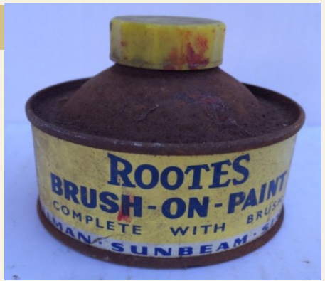
Vintage Rootes Tartan Red Paint Tin, Automobilia, Hillman, Sunbeam, Singer, Commer. SP £5.99