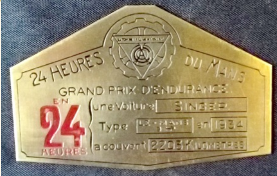
Authentique Plaque d'endurance Singer Type Le Mans 9HP - 1934 24 heures du Mans. Buy it Now for 230 Euro - approx £199