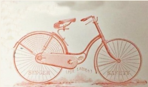
LADIES' SINGER SAFETY.

The pamphlet is pretty beat up. Most of the pages are ripped, wrinkled or/and stuck together. However, there are some nice illustrations of their bikes still visible. This listing was ended by the seller because the item is no longer available.