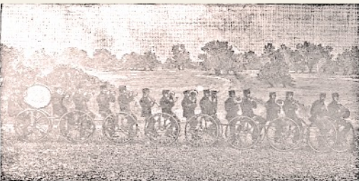
SINGER'S APOLLO BAND.