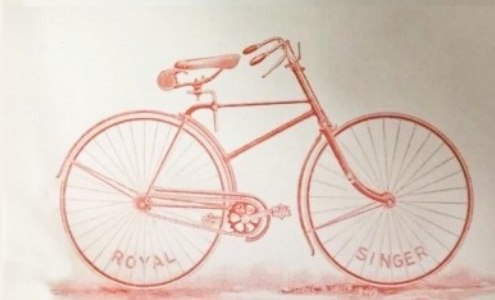
ROYAL SINGER SAFETY.