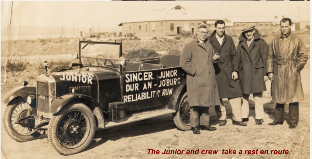
The Junior and crew take a rest en route.

Having failed to sell at £99.99, the collection, which was in Cape Town, was relisted and sold for £45.00.