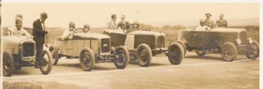
Start of the Light Car Race at Brooklands on February 23rd. Singer "Green Ray" second from left.